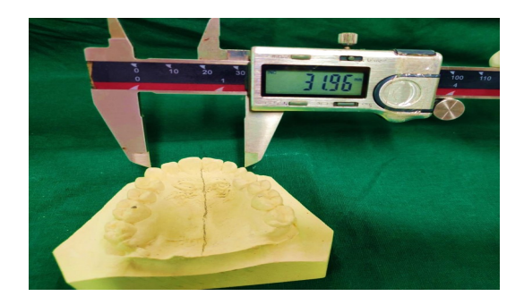
FIGURE 2 Measurement of maxillary inter-canine width (ICW)